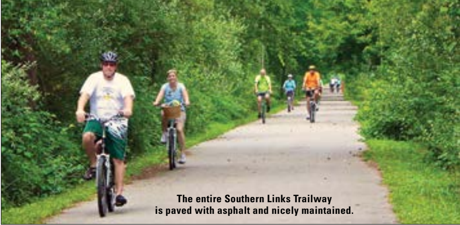
The entire Southern Links Trailway is paved with asphalt and nicely maintained.